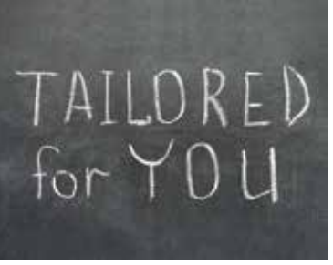
We are committed to provide product specialisations, accessories, options and specific process know-how that ensure solutions tailored to the user's needs.