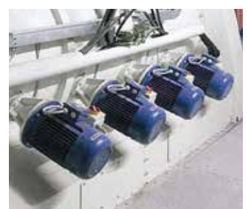
Liquid injectors and choppers