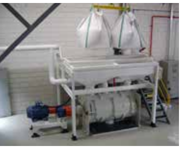
Profound knowledge of the Cosmetics Industry enables MAP® to identify the most suitable solution for virtually any application.